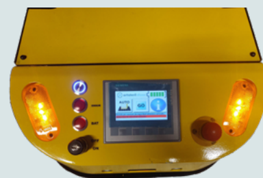
DETAIL OF THE SCREEN